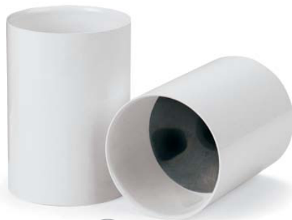
Practice Green Plastic Putting Cup